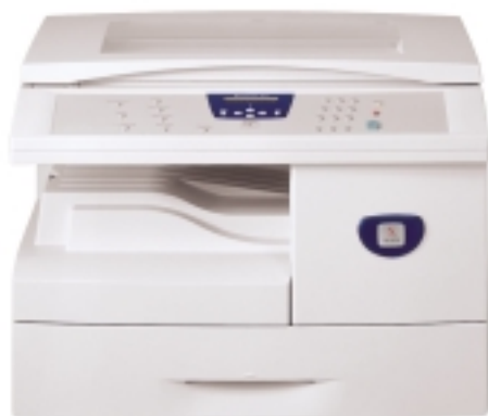
WorkCentre M15 with platen cover