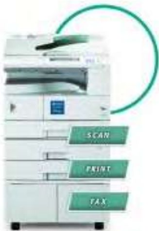
2016spf: For efficient document management in a space-saving design.

Select the configuration that meets the needs of your office.