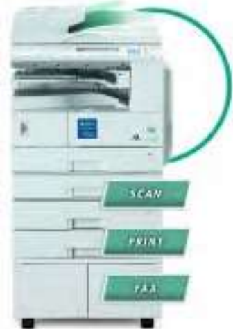
2020Dspf: For total document management, including a One-Bin Tray and Duplexing capability.