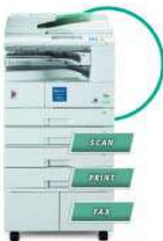
2020spf: For productive document management, including a One-Bin Tray.