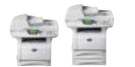
DCP-8025DN Without / with lower tray ■ Network Interface as Standard ■ Duplex Printing as Standard