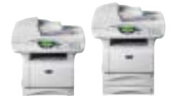
DCP-8025D Without / with lower tray ■ Optional Network Interface ■ Duplex Printing as Standard