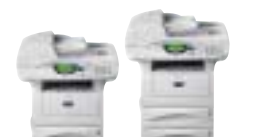
DCP-8020 Without / with lower tray ■ Optional Network Interface