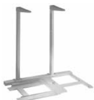
hp digital copy stand C4231A