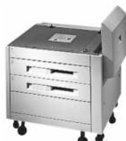
hp 2 x 500 sheet input tray C4780A