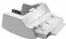
hp envelope feeder C3765B