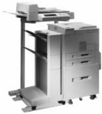
hp LaserJet 8150mfp*