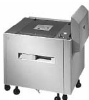
hp 2000 sheet input tray C4781A