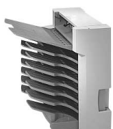
hp 7 bin tabletop mailbox C4783A