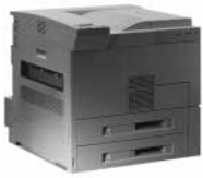
hp LaserJet 8150/n/dn